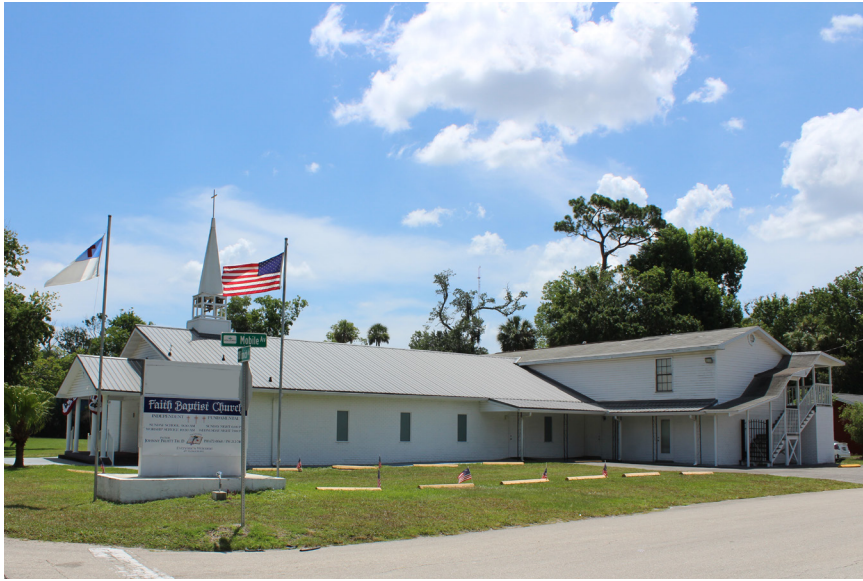
The Lighthouse on the corner of Flomich St. and Mobile Ave.

Faith Baptist Church 497 Flomich St. Holly Hill, FL 32117 WWW.FBCHollyHill.com 8/01/2020